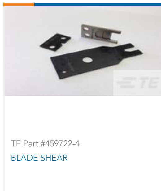
TE Part #459722-4 BLADE SHEAR