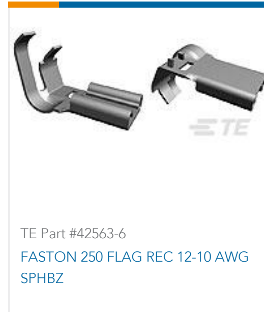
TE Part #42563-6 FASTON 250 FLAG REC 12-10 AWG SPHBZ