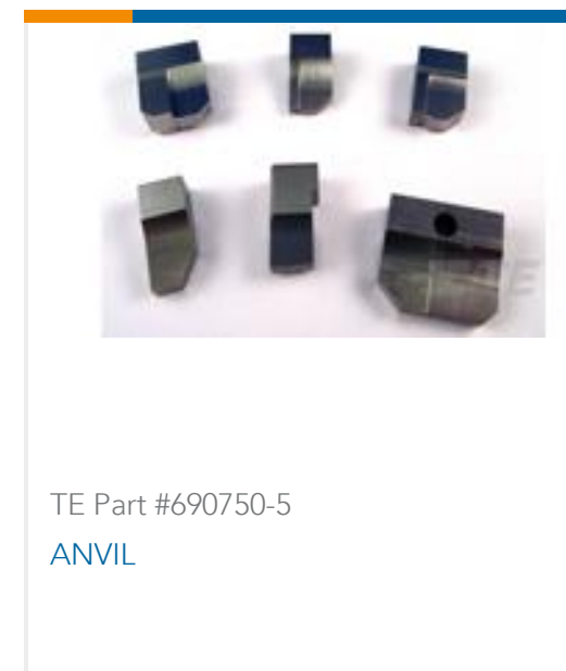
TE Part #690750-5 ANVIL