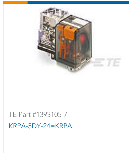
TE Part #1393105-7 KRPA-5DY-24=KRPA