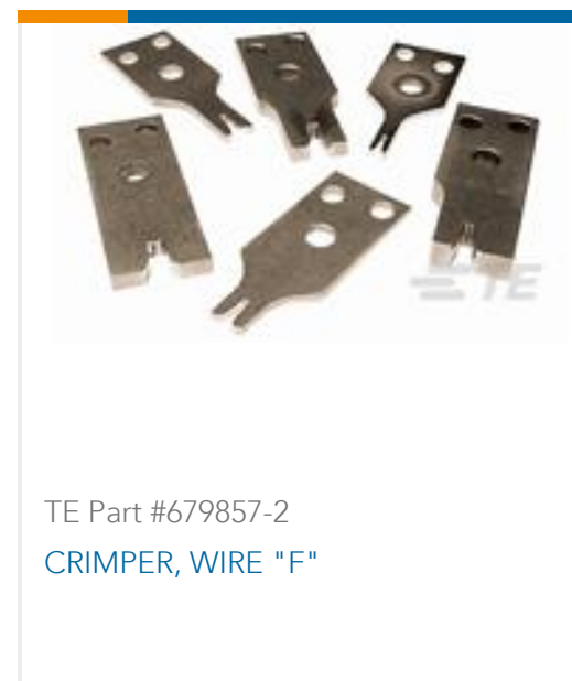
TE Part #679857-2 CRIMPER, WIRE "F"