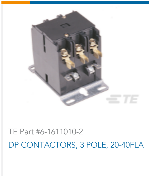
TE Part #6-1611010-2 DP CONTACTORS, 3 POLE, 20-40FLA