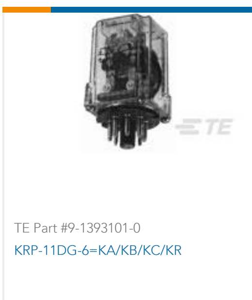
TE Part #9-1393101-0 KRP-11DG-6=KA/KB/KC/KR