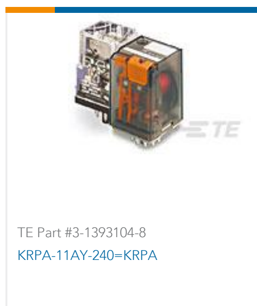
TE Part #3-1393104-8 KRPA-11AY-240=KRPA