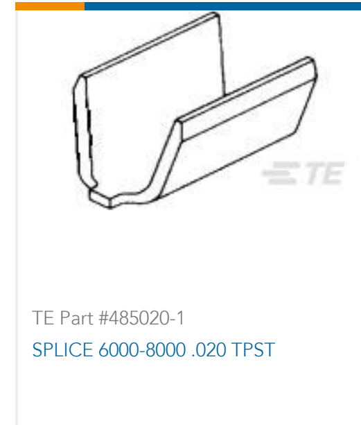
TE Part #485020-1 SPLICE 6000-8000 .020 TPST