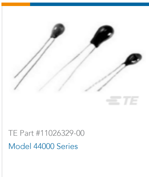
TE Part #11026329-00 Model 44000 Series